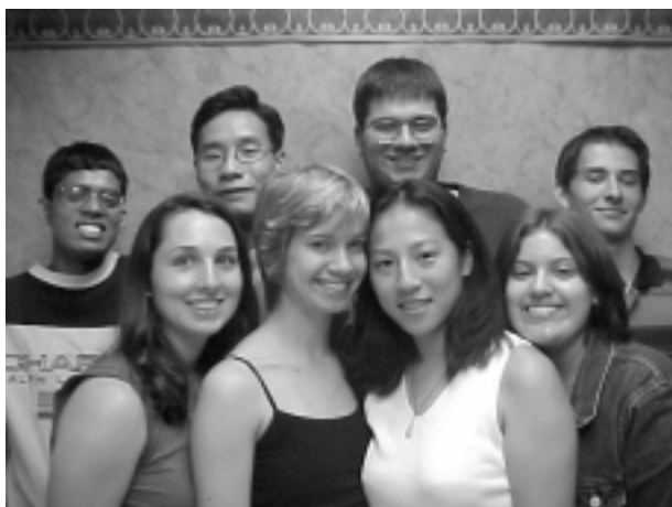
Class of 2002 Wakefield Scholars

I look forward to meeting many of you throughout the anniversary celebrations.