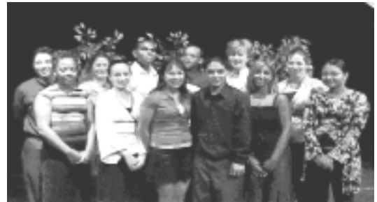
2004 Wakefield Scholars

To honor large donors, scholarships were named for the following this year: