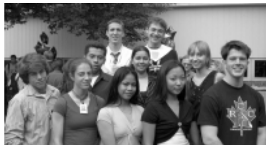
2005 Wakefield Scholars

class of '85 - http://groups.yahoo.com/group/wakefield1985/