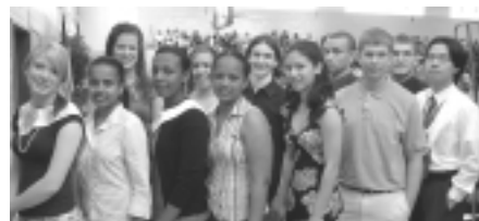
2006 Wakefield Scholars