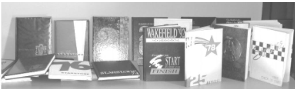
Yearbooks and 1960 jacket on display at the recent oral history program