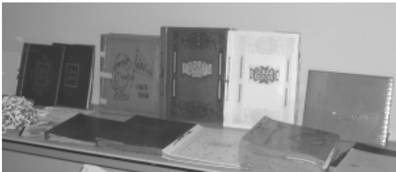
Scrapbooks on display at the recent oral history program

* Indicates that multiple contributions were made in the name of this person.