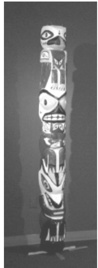
Totem Pole Given by the Class of '57