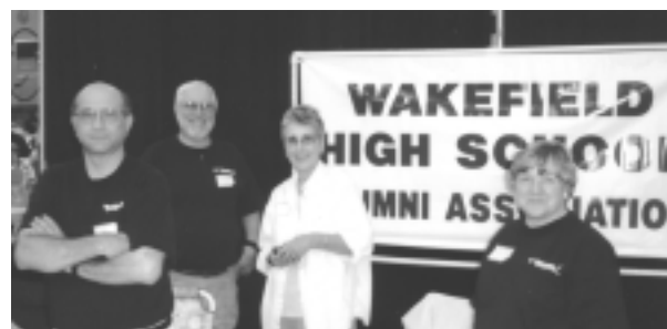
The Alumni Association greeted visitors to the Arlington County Fair